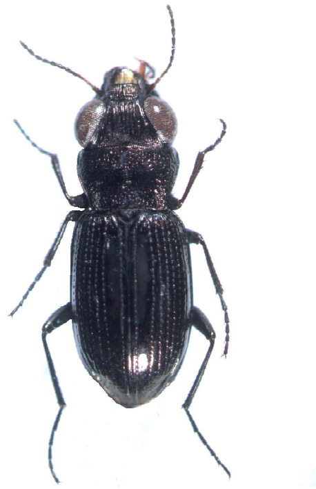
Fig. 1. Notiophilus semistriatus Say

Author's private collection (ABC) of the genus Notiophilus Dum. is used as a basic collection, it is kept in Daugavpils, Latvia. In the collection more than 700 specimens of this genus are being kept, they represent 44 species, besides 5 types of taxa described by the author are deposited in the collection, the list of them is summarized in Table 2.