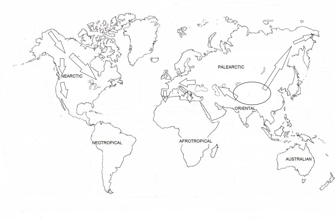
Fig. 3. Hypothetical origin centre of species of the genus Notiophilus Dum.

If compared with other regions, in Europe only 14 species can be distributed, none of them is endemic species, in Northern Africa and Macaronesian archipelagos – 5 species, all of them can be found in Southern Europe as well. 16 species, which can be found in Nearctic, also can not be conspicuous for narrow localized number of endemics. Only two species N. semiopacus Eschsch. and N. sierranus Casey, which can be found in highland regions of Arizona and California, can be considered to be endemics localized in comparatively small territories. In the west of Northern America number of specie of the genus Notiophilus Dum. is bigger than in the east of the continent. Similar situation is also with both unique species found outside Palearctic –